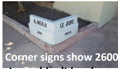
Corner signs show 2600 Le Jeune (don't be alarmed)