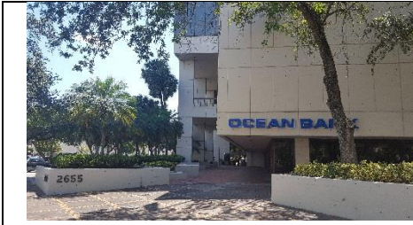
OCEAN BANK (2655 Le Jeune Rd)

We are located between “Ocean Bank” and the “Infinity building”