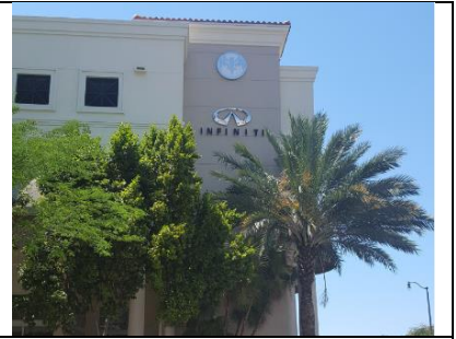
INFINITY BUILDING (view corner Almeria and Le Jeune, accros from our building)

From North Miami Beach or North Miami : Take I95 South from North Miami and follow signs for 112 West to exit “Le Jeune Road” (42 nd ave) - Take a left on Andalusia Ave (after Miracle mile/coral way), right on Salzedo Street, and Right on Almeira Avenue, last gray building on the right before Le Jeune Rd, enter parking. Please note that you cannot turn left on Almeria Avenue from Le Jeune Rd North.