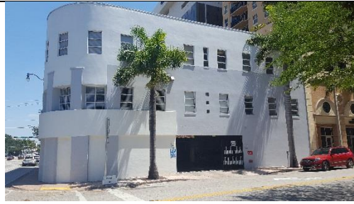
US: Corner of ALMERIA AVENUE and 2695 LE JEUNE ROAD